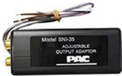
Line out level

Front AND rear/subs will require a line out level to RCA converter. Custom wiring to the included wire-harness required. You will need to purchase two converters (for front and rear) because each adapter is only 2 channels.