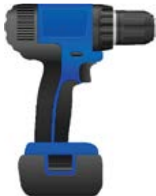
Electric drill (if you have)